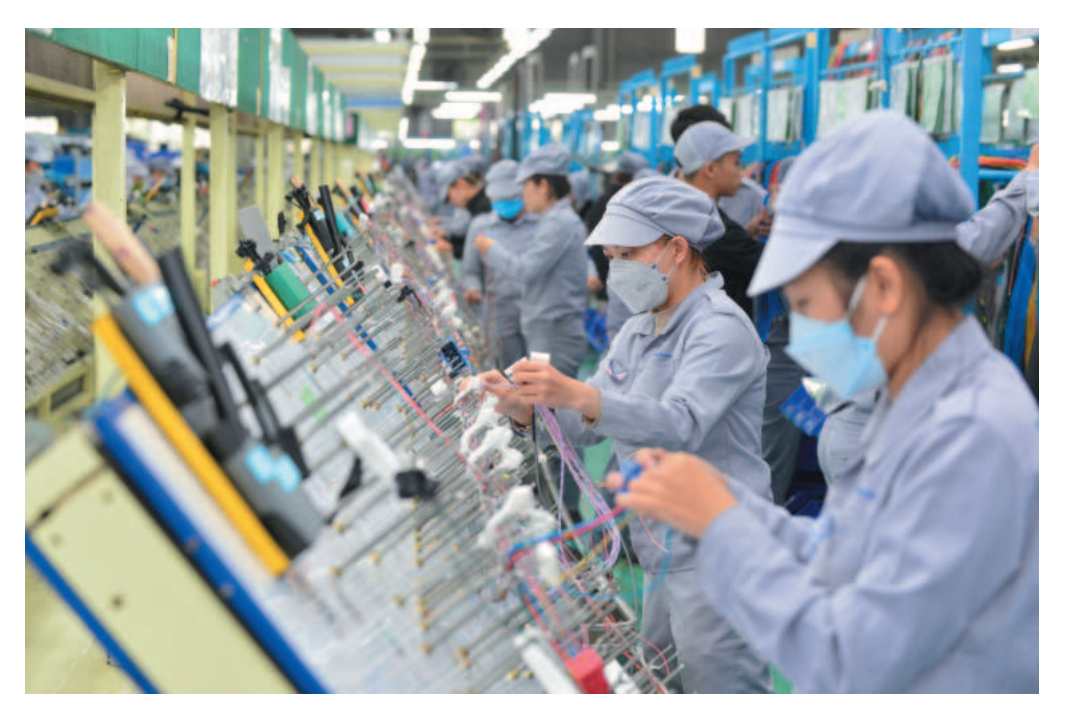
Vietnamese companies are urged to strengthen their integration and participation in global supply and production networks

and R&D-driven collaborations to develop new, high-quality technologies and solutions presents a valuable opportunity for Vietnamese companies. It enables them to achieve sustainable development, enhance competitiveness and adaptability, expand and develop markets, boost exports, and fully leverage the advantages offered by new-generation free trade agreements. However, to take advantage of the investment environment and see Vietnam as a manufacturing destination, in both macro and micro perspectives, Vietnam needs to make more efforts.