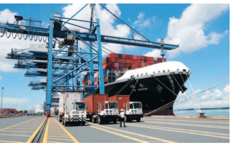
Vietnam's economy grew by 6.42% in the second quarter, and if this trend continues, GDP growth for 2024 is projected to reach 6-6.5%