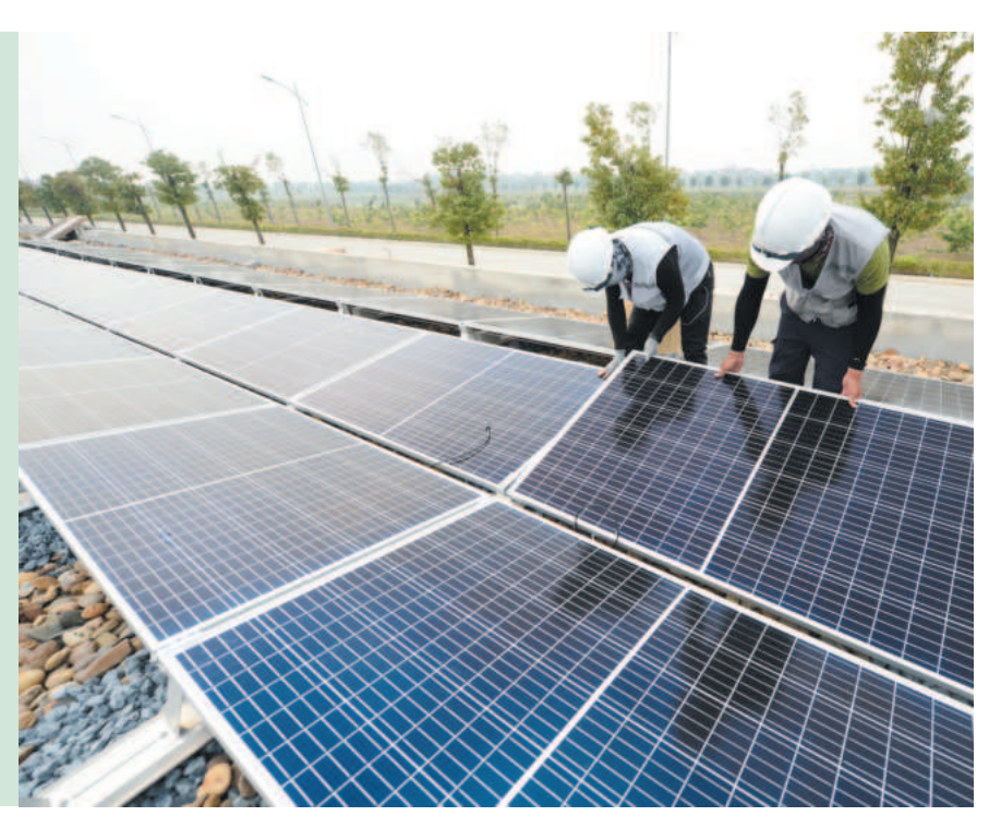
The Direct Power Purchase Agreements (DPPA) aim to reduce reliance on Vietnam Electricity (EVN) and the national grid, boost market competitiveness, and address EVN's financial issues