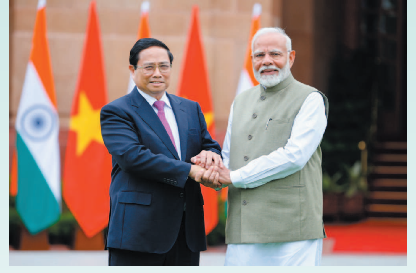
Indian Prime Minister Narendra Modi (R) welcomes Vietnamese Prime Minister Pham Minh Chinh at the presidential palace, New Delhi, August 1