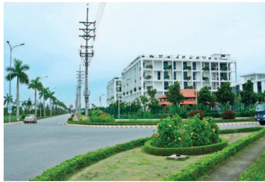
Projects in Thang Long Vinh Phuc Industrial Park are designed with a focus on environmental sustainability and utilize cutting-edge technology

In addition, Thang Long Vinh Phuc Industrial Park Co., Ltd and secondary investors always carry out good social activities to build an image of an industrial park that is not only a place to find job opportunities but also a pioneer in building and improving the living standards of local people. In 2020, with the permission of the local government, Sumitomo