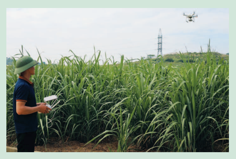
Vietnam is increasingly adopting high-tech and smart agriculture practices to promote sustainable development

Therefore, it is necessary to promptly reform the