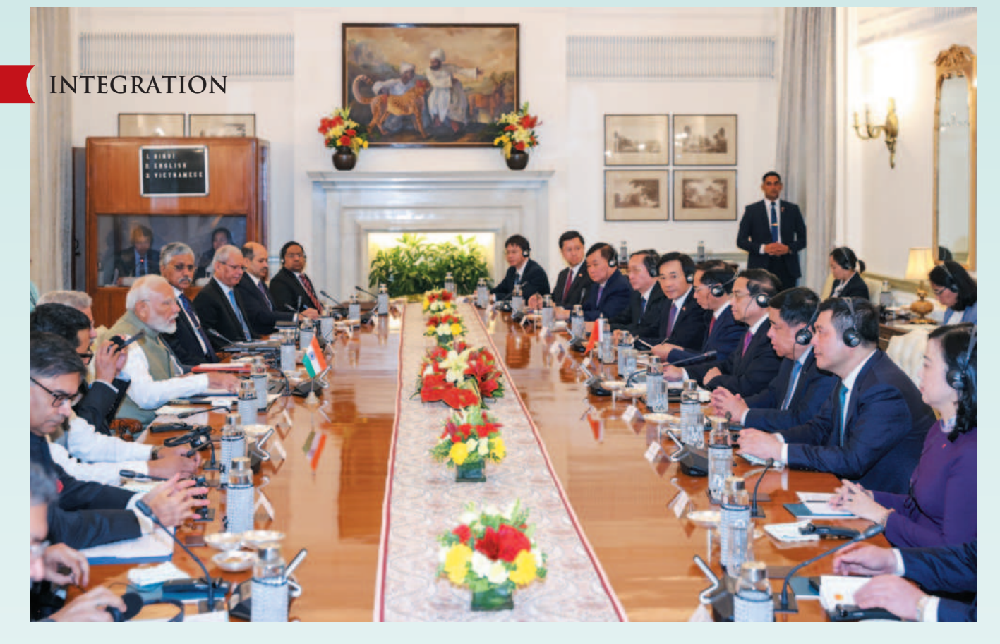
During their discussions, Prime Minister Pham Minh Chinh and Prime Minister Narendra Modi are committed to implementing strong measures aimed at doubling bilateral trade and investment turnover by 2030

recent years, including the India - Vietnam Joint Vision for Peace, Prosperity and People in 2020, and the outcomes of the meetings between Prime Minister Narendra Modi and Prime Minister Pham Minh Chinh on August 1 2024 in New Delhi, among others.