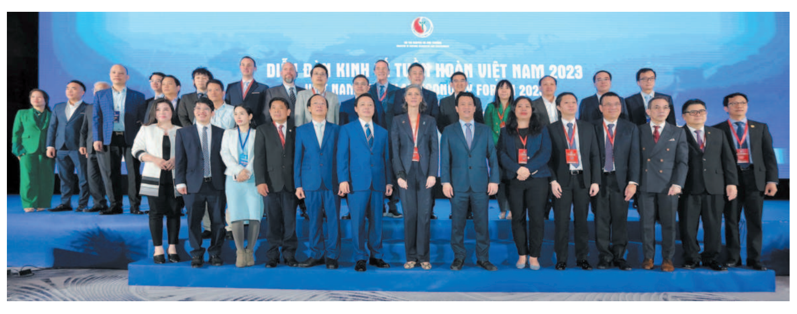
SCG participates in the Vietnam Circular Economy Forum 2023, highlighting its commitment to sustainable practices and circular economy principles

SCG has been honored as the Top 1% S&P Global Corporate Sustainability Assessment in the Sustainability Yearbook 2024 by S&P Global Inc. SCG is the first ASEAN company to be selected for the DISI World Index since the Sustainability Yearbook's inception in 2004, reflecting its long-standing leadership in sustainability for 20 years along with the DJSI. The recognition is a testament to SCG's ESG commitments (Environmental, Social and Governance) to achieve Net Zero by 2050 and shape a green and sustainable future for ASEAN, including Vietnam.