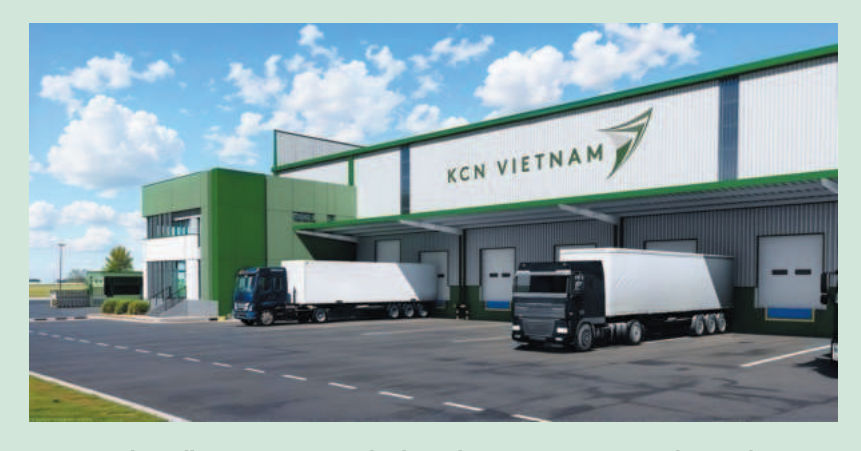
Projects that adhere to green standards, such as KCN DEEP C - Hai Phong (Phase 02) by KCN Vietnam Group, aim to ensure a balance between environmental and economic efficiency

KCN Vietnam Group's debut initiative in green building standards is the construction of Phase 2 at their Deep C - Hai Phong project, with the goal of attaining LEED Silver certification. This project ensures optimal energy and resource use, potentially saving up to 25% in energy and reducing water consumption by 10%, while significantly lowering carbon emissions compared to traditional projects. This initiative would potentially offer financial advantages, while also enhancing employee satisfaction and productivity, ultimately benefiting the community. LEED is among the top prestigious green building certifications in the world, developed by the U.S. Green Building Council (USGBC). For the KCN Deep C