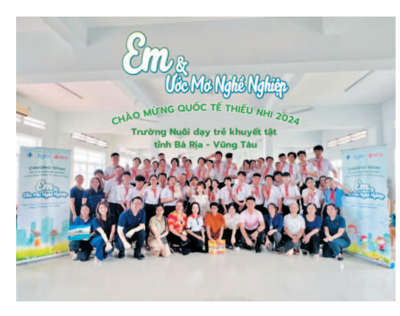
The career guidance program for parents and disabled students organized by SCG in collaboration with DRD Vietnam

annual SCG Sharing the Dream Scholarships, which has been organized for the past 17 years. Besides financial support, over 5,500 Vietnamese students have the chance to engage in meaningful activities, from factory tours to workshops, extracurricular activities, and ESG Camp to gain insights into real-world ESG practices. Meanwhile, SCG has also collaborated with Ba Ria - Vung Tau School for Children with Disabilities to improve the quality of education and life for disabled students for the past 15 years. Starting this year, the group launched the "My Career Dream" initiative to help disabled students explore career opportunities, thereby contributing to reducing inequality in society.