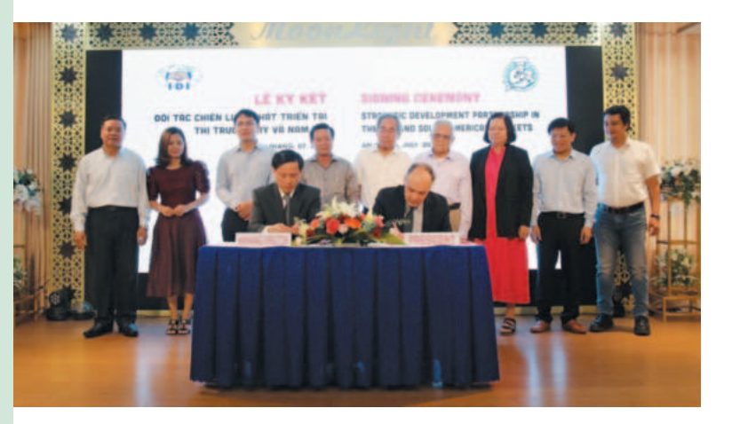
IDI Seafood Corp and Patagonia Cuisine LLC agree to cooperate in developing the US and South American markets

Accordingly, IDI is among the six Vietnamese pangasius exporters benefiting from reduced anti-dumping duty rates. This competitive edge provides the