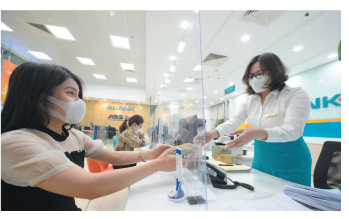
Credit growth accelerated significantly, rising from 3.4% year-on-year at the end of May to 6.0% by the end of June

Regarding the preferential loan package of VND120 trillion for social housing and worker housing development, the SBV is asking the Government to increase preferential conditions for home buyers while businesses will still enjoy previous incentives, he added. At the same time, the central bank will also encourage and facilitate commercial lenders to take part in the program. As for the support package of VND30 trillion for forestry and fishery, if fully implemented, the banking sector will have additional capital (VND15 trillion) to support target borrowers because these sectors create momentum for exports.■