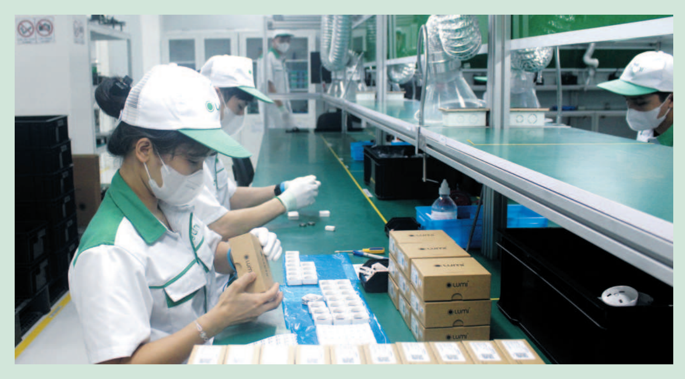
Lumi Smart Factory in Thang Long Vinh Phuc Industrial Park

Despite facing various challenges and obstacles, tenants in Vinh Phuc province's industrial parks (IPs) have successfully navigated these difficulties and leveraged favorable opportunities. They are now stabilizing and ramping up their production and business operations, which is fostering growth, generating additional employment opportunities, and contributing significantly to the local socioeconomic development.