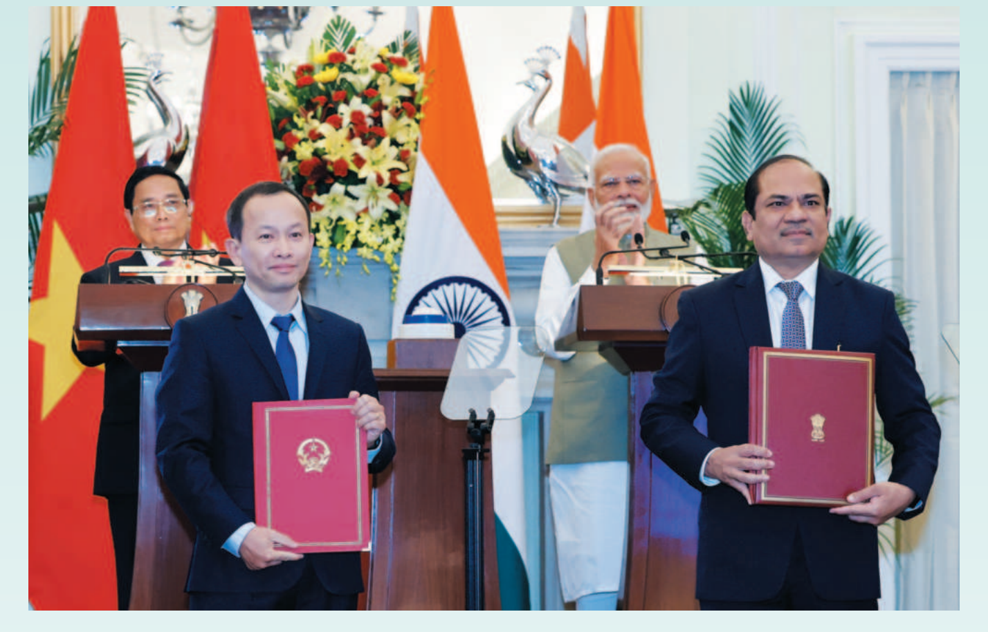
The two Prime Ministers witness the signing of nine cooperation agreements between the two countries

commerce and digital economy. Support businesses from both sides to participate in e-commerce and digital platforms to take advantage of e-commerce in improving export capacity and participating in regional and global value chains in a sustainable way. They also encourage relevant government agencies and businesses of both sides to explore cooperation opportunities in green economy, circular economy, digital economy and critical industries such as rare earth elements, semi-conductor, nano materials.