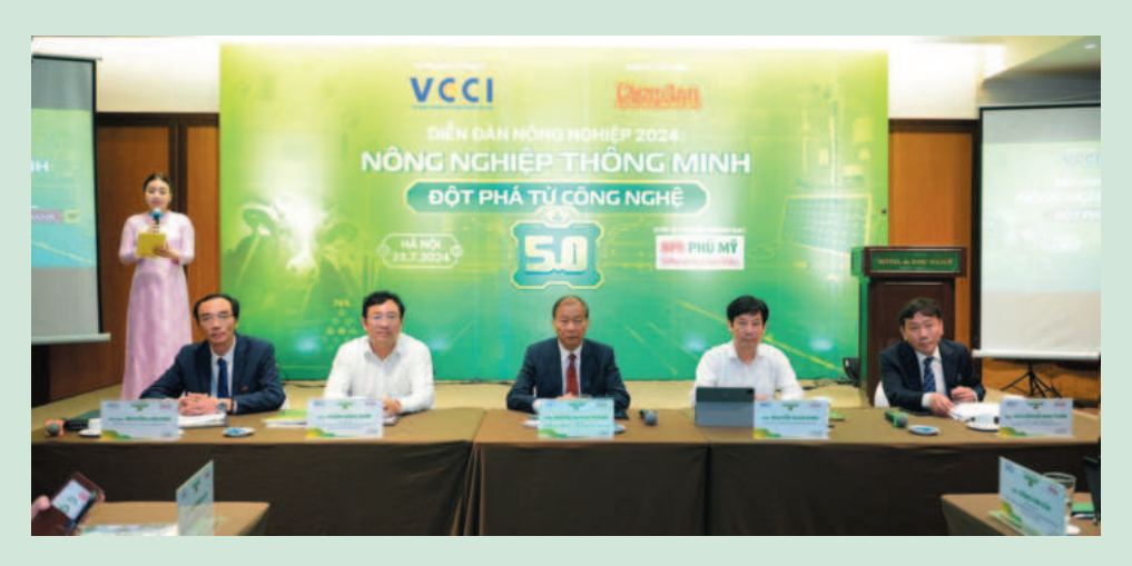
Agriculture Forum 2024: Smart Agriculture Breakthroughs from Technology 5.0

After nearly 40 years of innovation, Vietnam's agriculture sector has always been a cornerstone of its economy. In 2023, Vietnam was among the top 15 global agricultural exporters with a US$26.4 billion export value, up over 17% from the previous year. Despite this success, challenges in sustainability and productivity remain. Vietnam is addressing these by integrating high-tech and smart agriculture solutions for more sustainable practices.