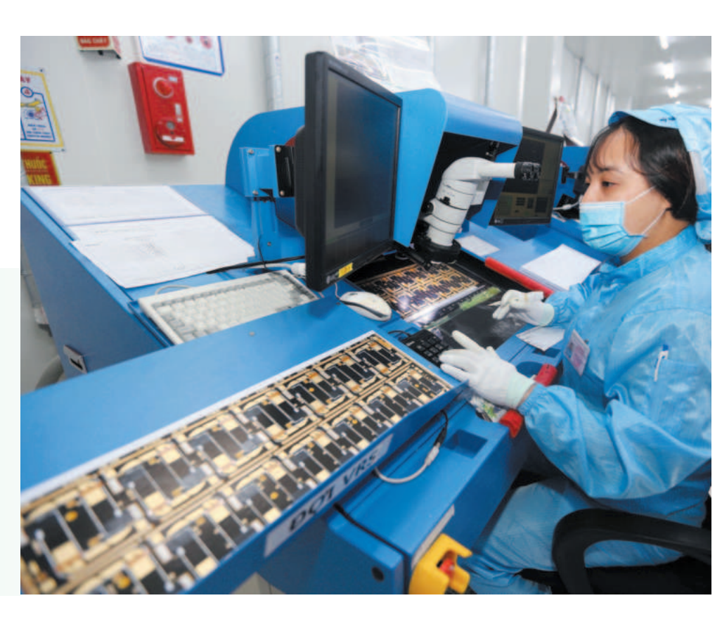
Exports of computer and electronic components surge by nearly 30% in the first seven months of the year